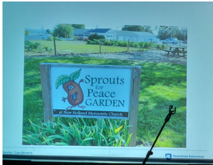
Logo design by Pastor Audrey

The project grew out of the interest of several congregational members for a community garden on the church property. After several months of planning, by the spring of 2019, with the support of the congregation, seeds and plants were put into the ground.